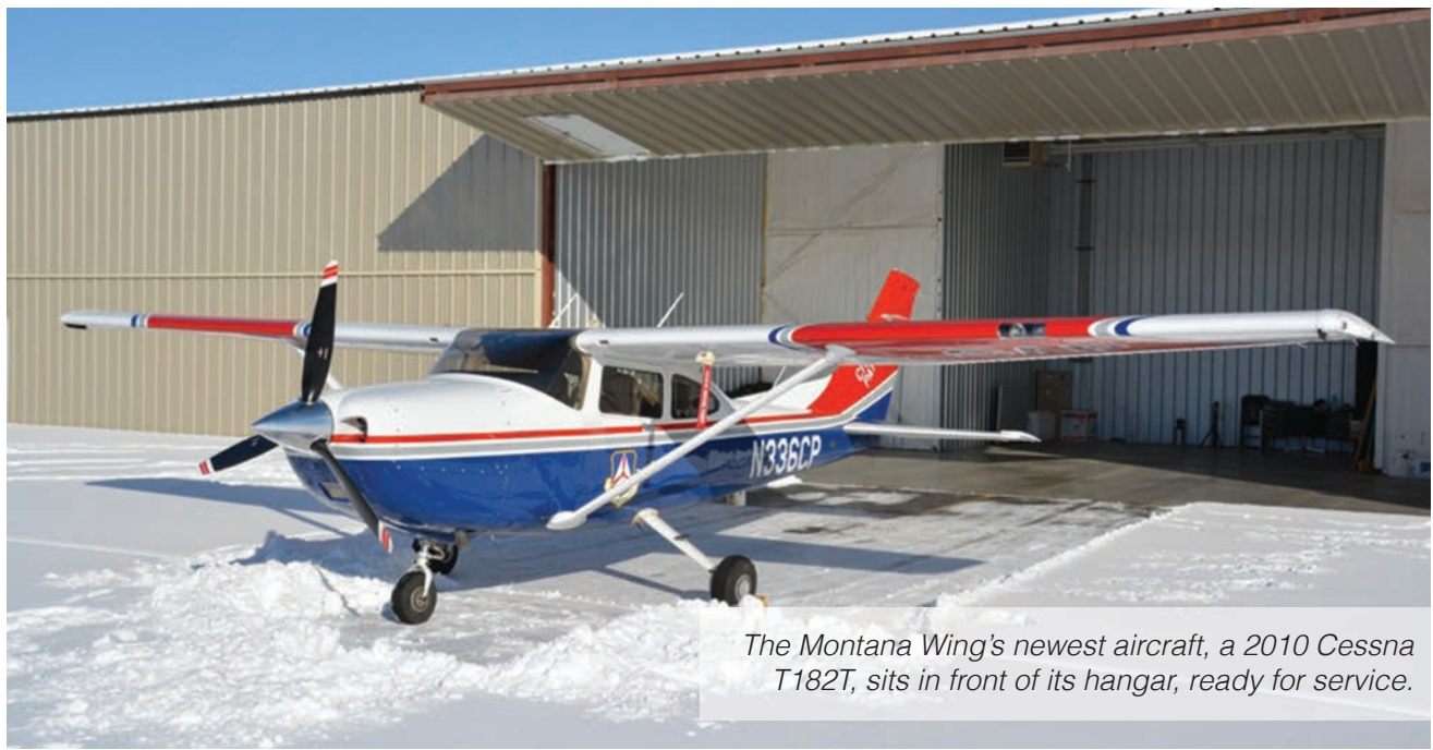
The Montana Wing's newest aircraft, a 2010 Cessna T182T, sits in front of its hangar, ready for service.