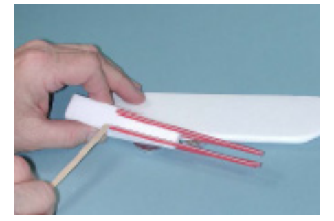
Step 4 – Glue the rudder to the ends of the four fuselage stirring sticks.

Step 3 – Using the template as a guide, glue the four plastic coffee sticks into place along the fuselage.