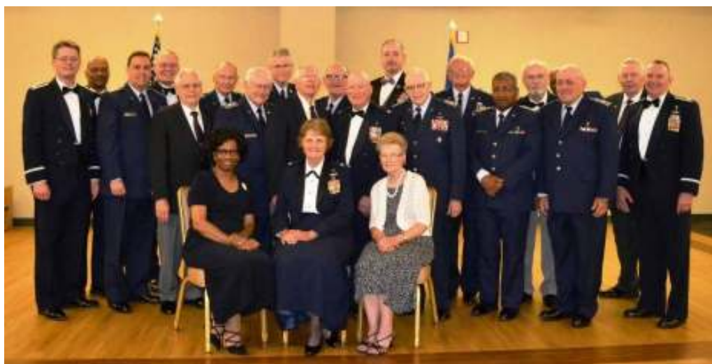
Attendees (left to right):