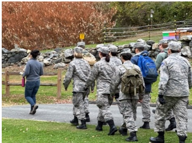
Cadets at the Great Hollow Nature Preserve in CT

Also, walking is free! To start walking for your health doesn't require joining a costly or inconveniently-located gym or investing in any special gear other than good sneakers or walking shoes (those are essential!). We already know how to walk, so unless one has a disability, no special or expensive training is required to start, as might be necessary to learn a new sport like pickleball, tennis, or squash, to name a few.