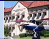
Table of Contents Contact Us